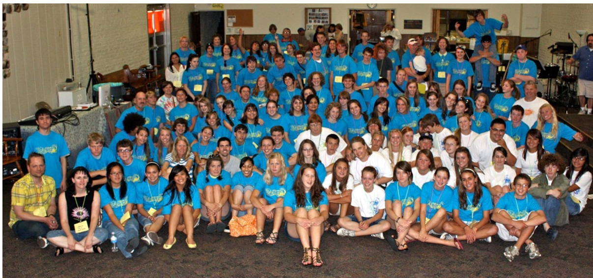
May 16th—Sierra Pacific Synod Pre-Gathering Bash in Sacramento ( Hope Youth in White )

Our group has a few new fundraisers coming up this month (Bake Sale - June 7 and Tri-Tip Sale - June 21). In addition to your financial support we would also greatly appreciate your prayers for all our youth as they prepare for the NYG and for the leaders who will go with them.